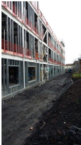
Photograph 1 Secondary steelwork completed on North Elevation

Photographs 1 - 10 illustrate the progress made since February 2017.