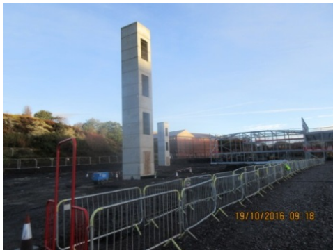
Photographs 7 and 8 Lift Shaft No 2 in October 2016 and now encased March 2017