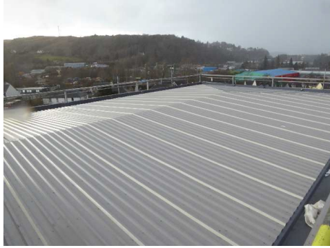
Photograph 3 Roof works over Dance Studios and Gymnasia