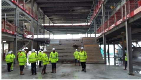
Photographs 5 and 6 Central Atrium view looking West and East