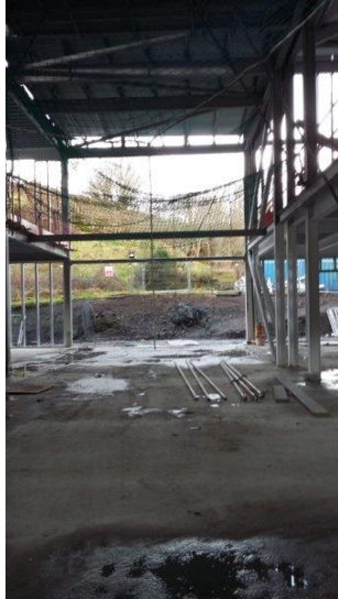
Photograph 9 The double height main entrance