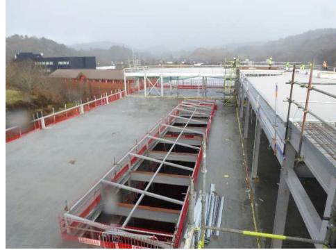
Photograph 4 Rooflights over central atrium