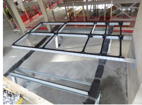
Photograph 10 Glazed screen elements assembled on site